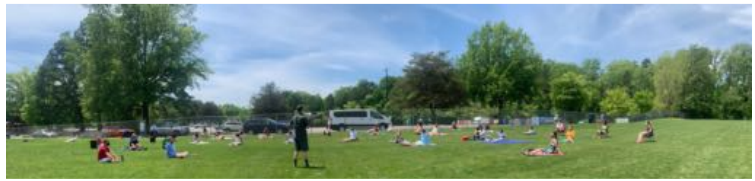
Our socially-distanced 2021 banquet!